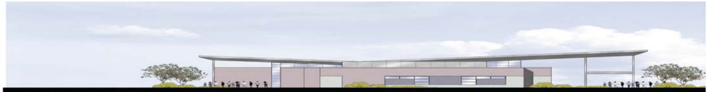
EAST (towards gym)

The remaining phases in the master plan from 2005, include the performing arts center and fields and site improvements. However, to date, funding for these two phases has not been approved.